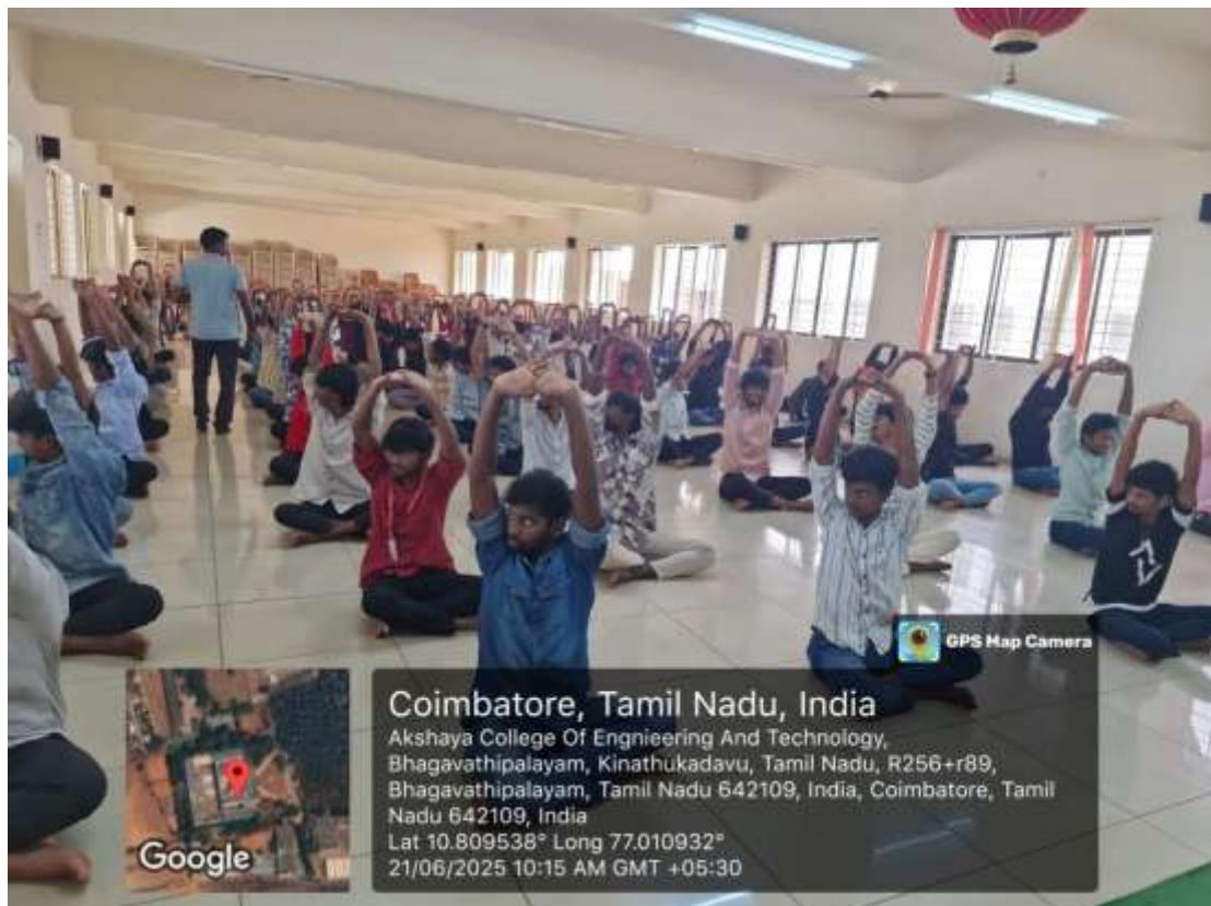
Students Participated in “Yoga for One Earth, One Health” programme conducted on 21.06.2025