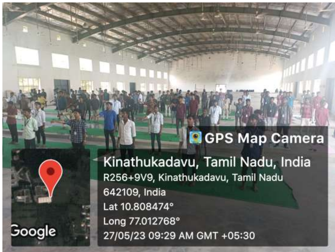
Students Participation in Certificate course on “Yoga for Youth Empowerment”